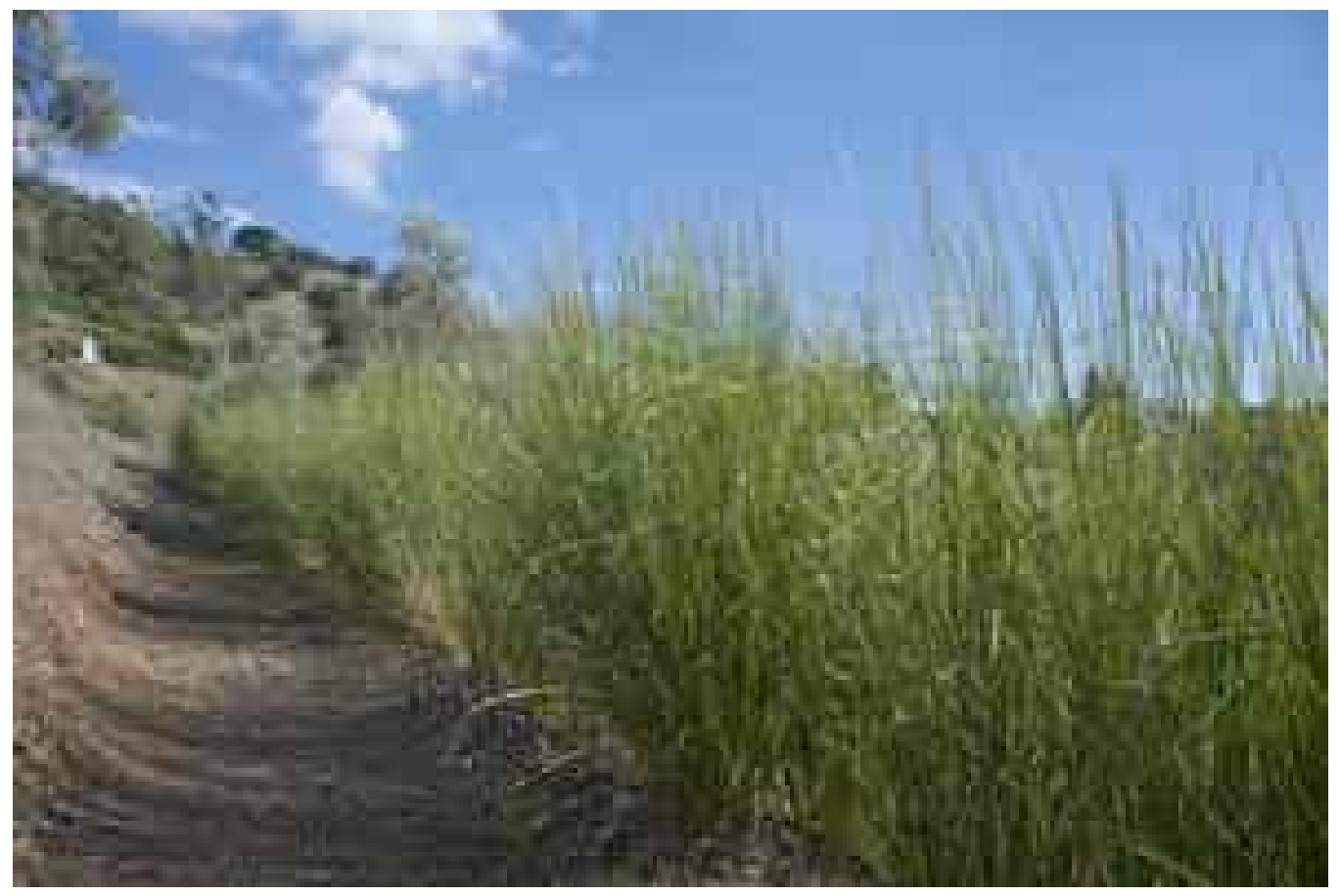
Their original hedgerow is now 5 years old. This has been used extensively as stock.